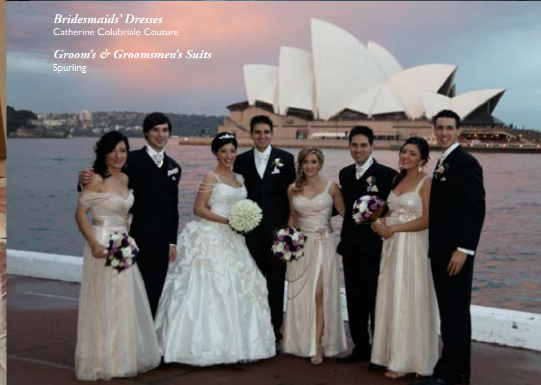
Bridesmaids' Dresses Catherine Colubriale Couture