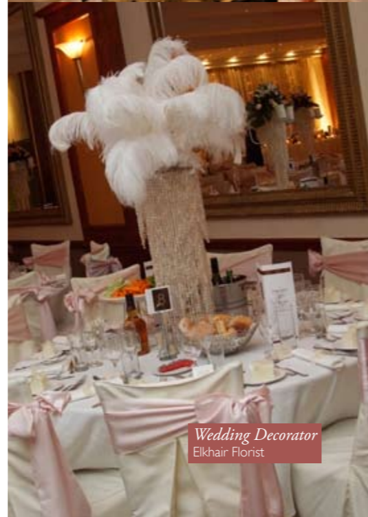
Wedding Decorator Elkhair Florist