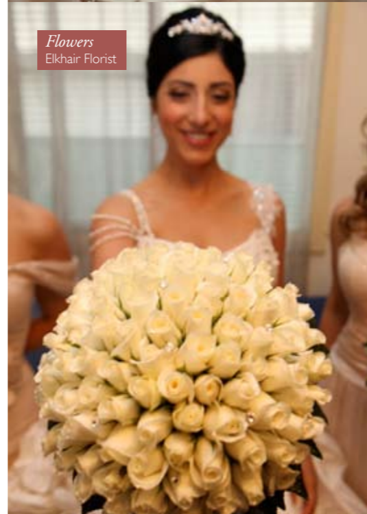
Flowers Elkhair Florist