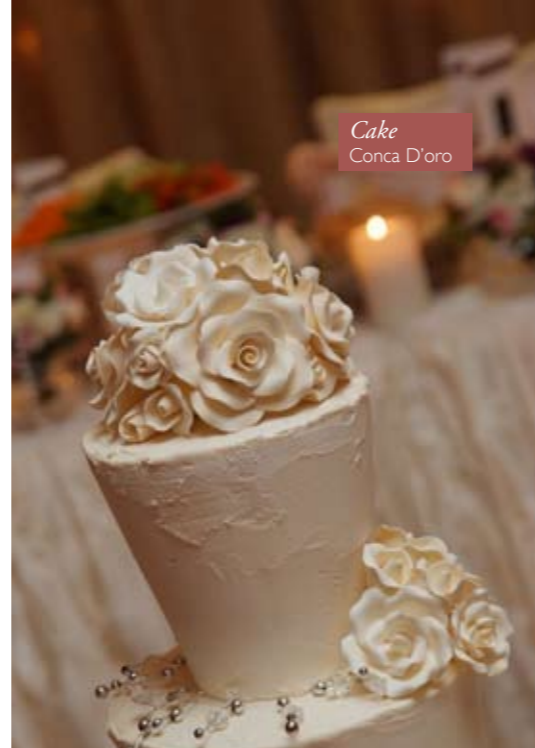
Cake Conca D'oro

TIPS FOR BRIDES TO BE Set weekly and monthly goals so that you have most things organised 2 weeks before the wedding day.