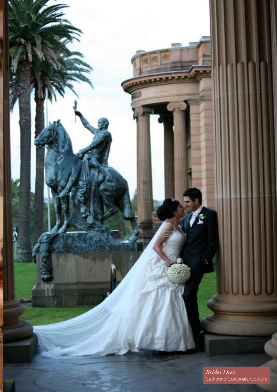
Bride's Dress Catherine Colubriale Couture